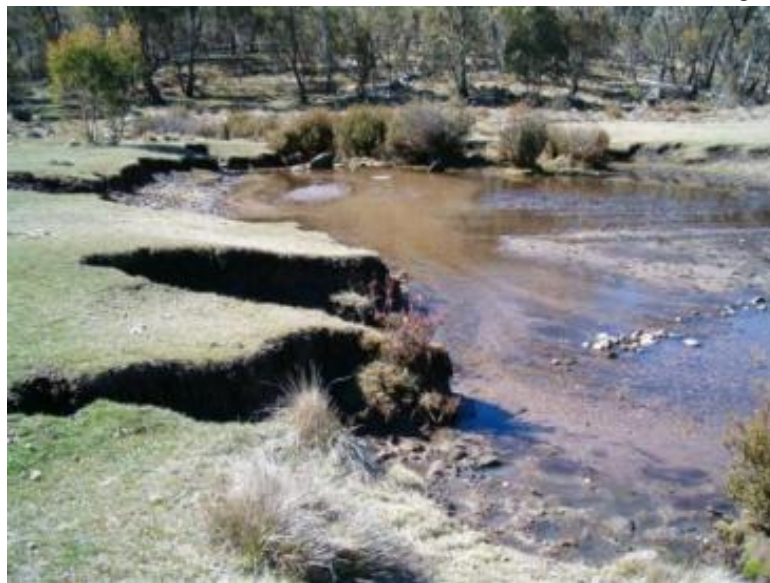
This location is known locally as Twin Culverts, Long Creek Bago SF.

The following is occurring at what was once a significant Montane Peatland and Wetland but now destroyed by cattle grazing and bad drainage along FNSW road across the wetland at location 613600E/6046550N (Yarrangobilly 8526-1-S, 1:25,000).