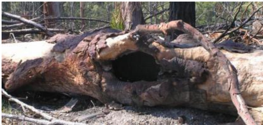
Habitat casualty in Mogo 160

Response: DECCW officers inspected the 40 metre wide ridge and head water habitats in Compartment 160 of Mogo State Forest. It was identified that the location of the mapped stream within Compartment 160 did not lie where it was mapped and, as such, the exclusion zone was shifted by Forests NSW to match the on ground location of the stream. The exclusion zone width was in accordance with the TSL requirements and there were no incursions. As such, no breach of the IFOA in relation to this matter was identified.