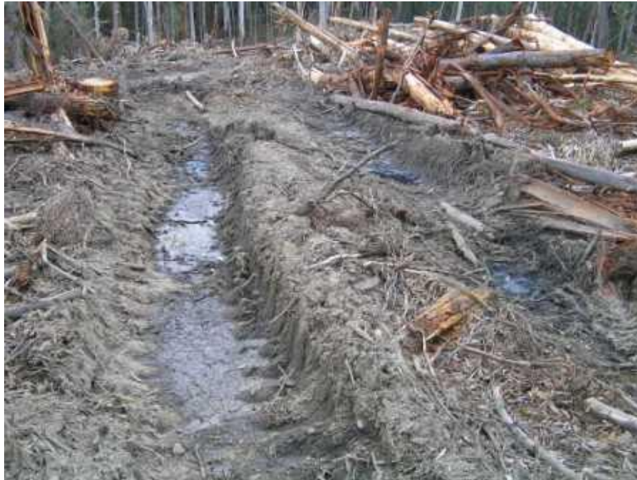
Deep rutting in old growth compartment 2029/1 Badja State Forest

We believe that a DECCW field audit would be productive and uncover further non-compliance with prescriptions.