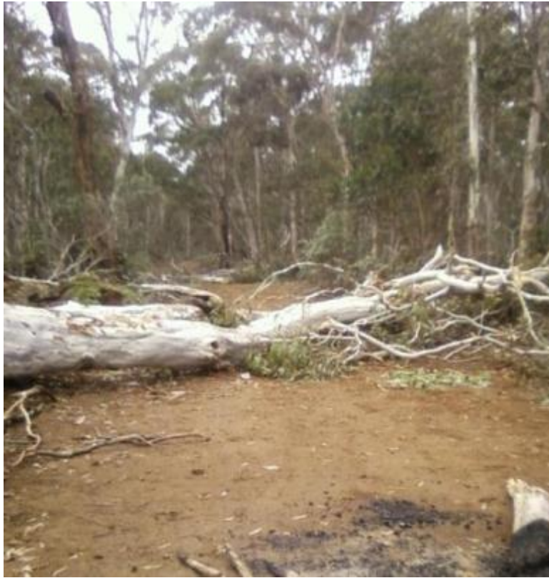
Felled hollow-bearing tree to block road in Tallaganda