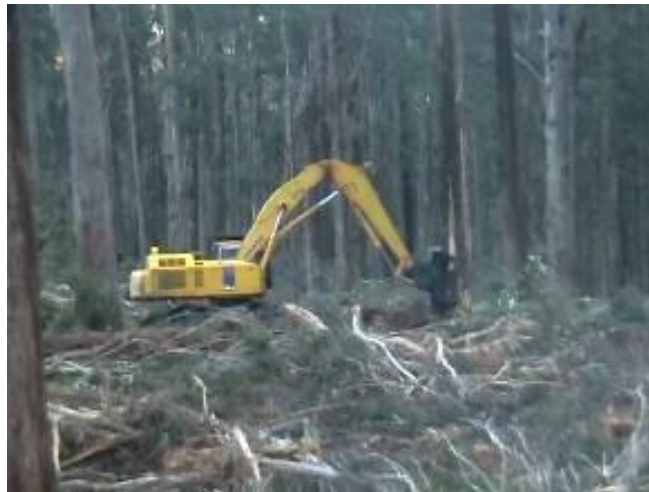
Mechanical harvester logging in Glenbog after Police assistance

It was also noted that the placement of dump C was far less than desirable, as it was put hard up against and into a small rocky outcrop. It is totally unacceptable for such flagrant disregard for the legal prescriptions to be remedied with a warning letter.