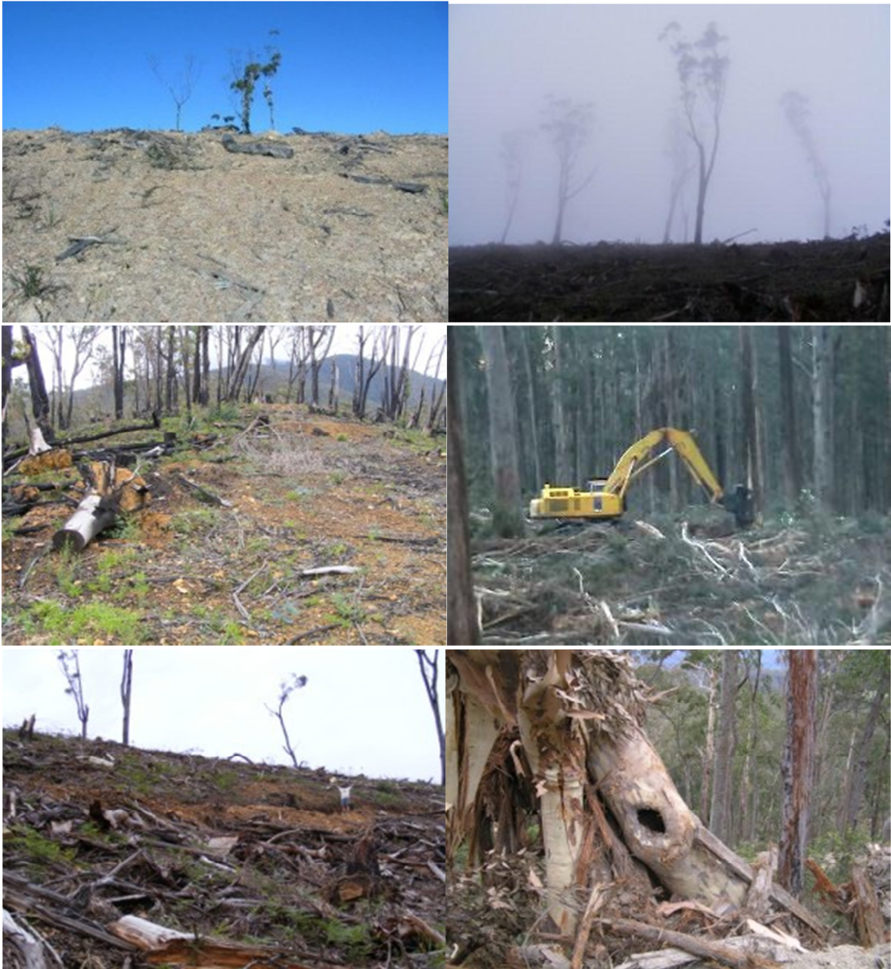
South East Forest Rescue 2011