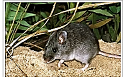
The smoky mouse is found in Nullica State Forest near Eden on the far south coast, one of just a handful of sites in NSW, Victoria and the ACT.