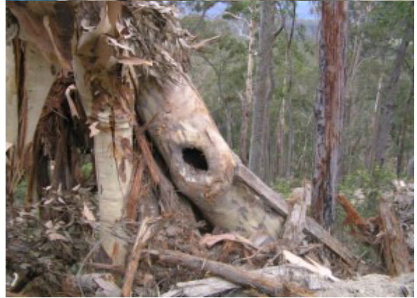
South East Forest Rescue ©2009